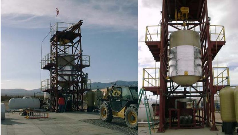
QuickReach™ Integrated Stage 2 (IS2) Secured on Vertical Test Stand (VTS)