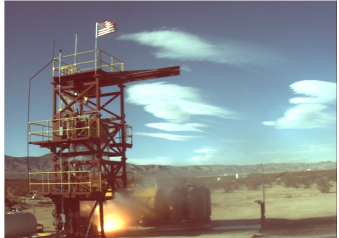
AirLaunch QuickReach™ IS2 Hot Fire Test on VTS