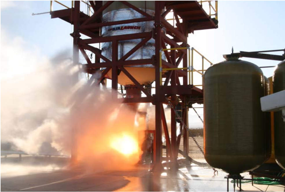
AirLaunch Conducted the Longest VaPak Burn of 191 Seconds