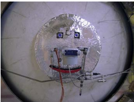
LOX Cover Insulation