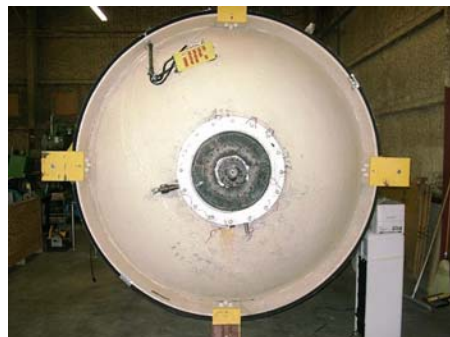
Patch Panel Installed