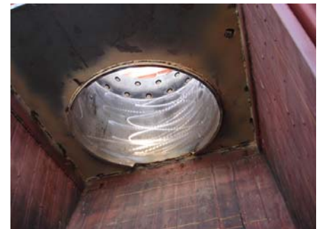
Deflector WRT Noise Support Ring