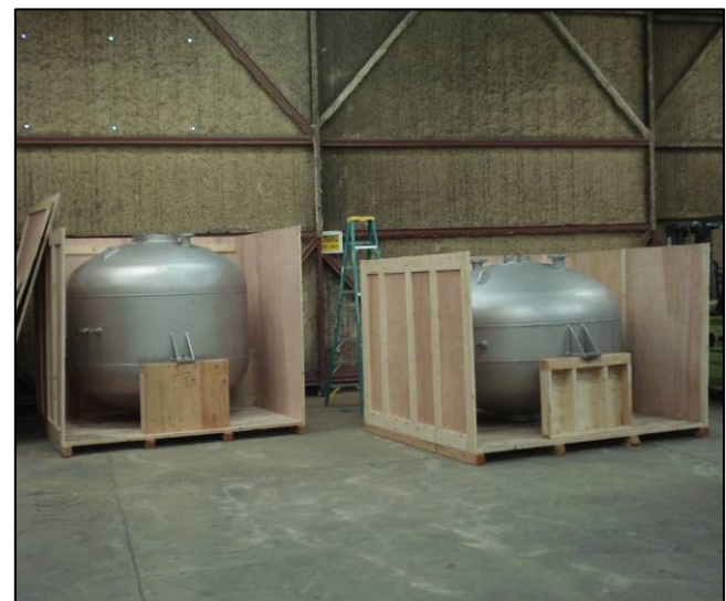
New Tanks for Vertical Test Stand (VTS) Complete

Rapid Prototyping Delivers Responsive Affordable Spacelift