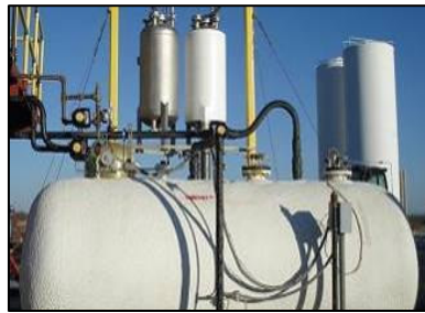
Propane Conditioning Tank