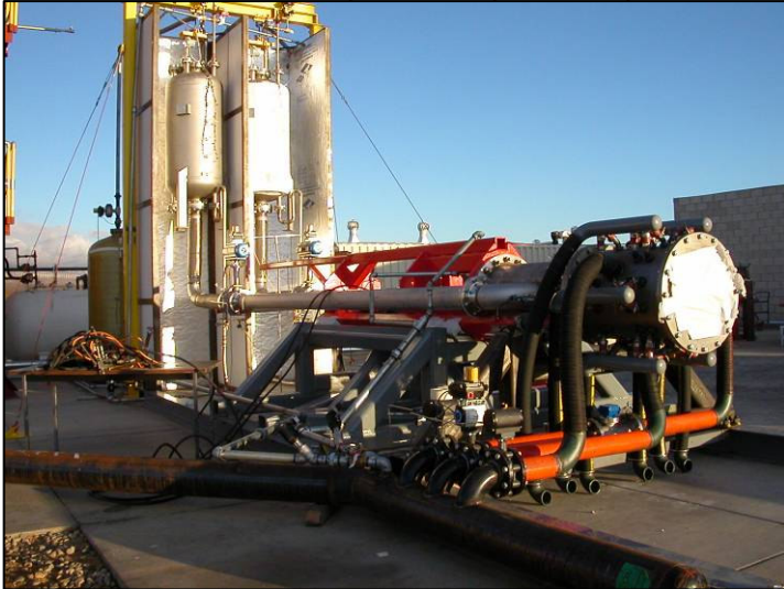
Completed Horizontal Test Stand (HTS-2)