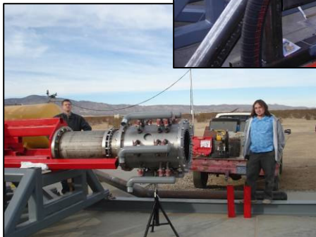
Nozzle Drum for HTS