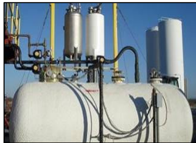
Propane Conditioning Tank