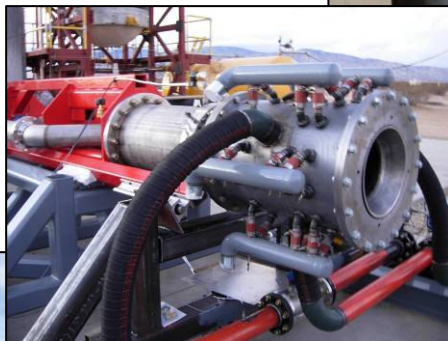
Chamber / Nozzle Installed