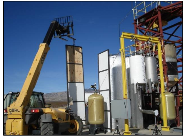
Door Section for Propellant Tank Enclosures