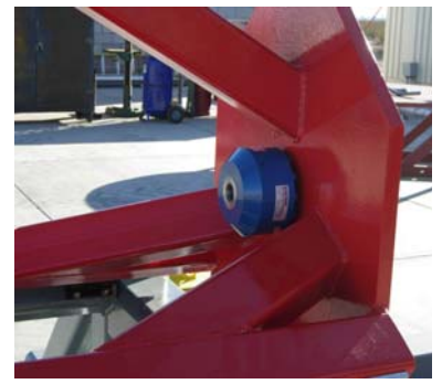
Calibration Load Cell