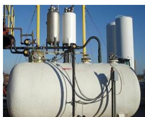
Propane Conditioning Tank