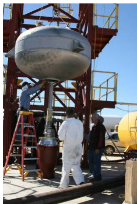
Downcomer fit-up with propane tank