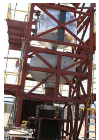
VTS New Tank Assembly and Nozzle Installed

Rapid Prototyping Delivers Responsive Affordable Spacelift