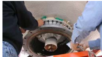
Adding L* Extension to Injector