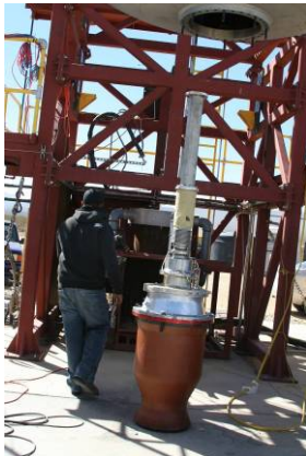
Downcomer assembly before installation