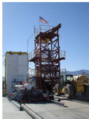
VTS New Tanks Complete (shown next to HTS-2)