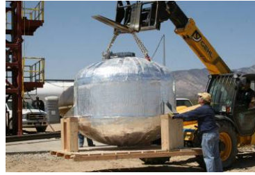
LOX Tank with Insulation