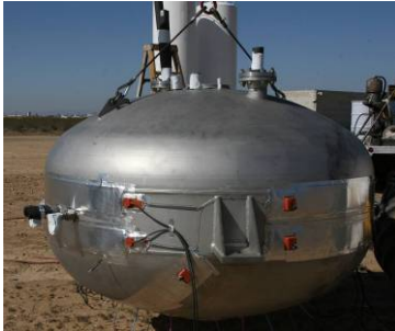
Propane Tank with band heaters, prior to insulation