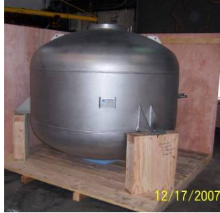
Propane Tank on Arrival LOX Tank on Arrival