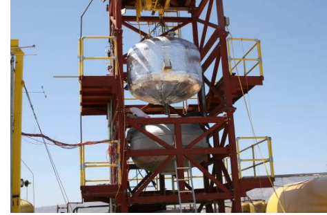
LOX Tank Installed