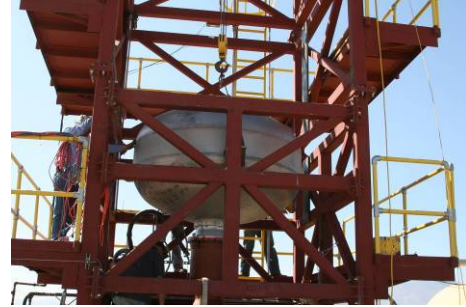
Propane Tank in Place