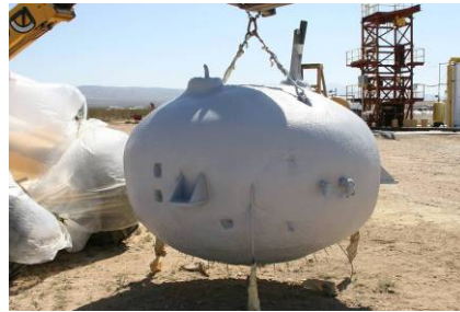
Propane Tank with Insulation