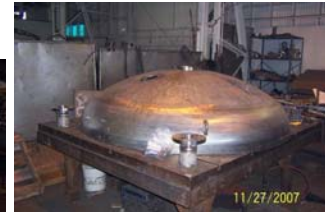
Propane Tank Head Prep for Nozzles