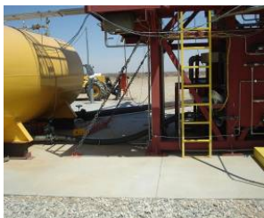
Water Cooling System