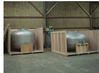
VTS Tanks Complete