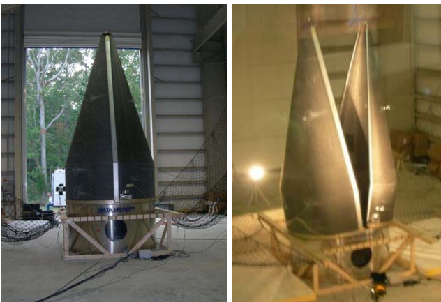
Payload Fairing Separation Test