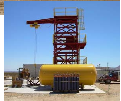
Vertical Test Stand