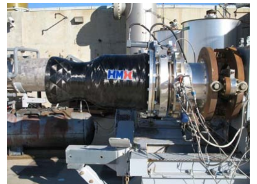
Bellows Gimbal on Stage 2 Engine