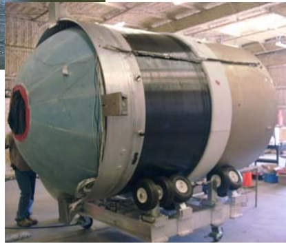
Integrated Stage 2 Being Readied for Test