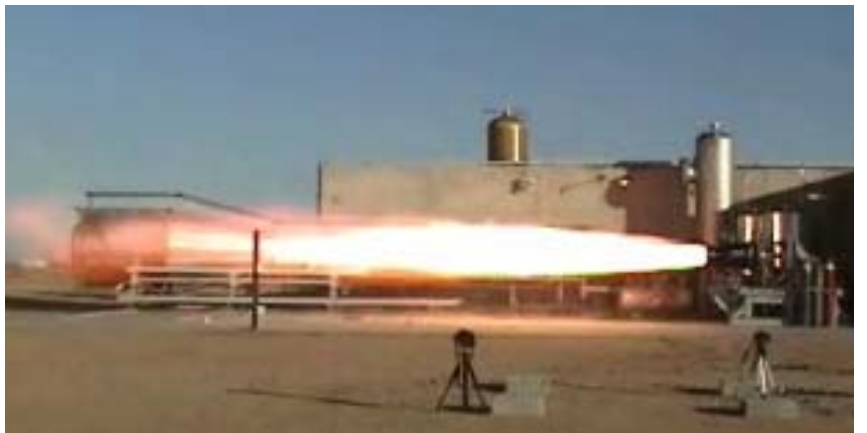
Stage 2 Engine 5-Second High Altitude Igniter Test

Rapid Prototyping Delivers Responsive Affordable Spacelift